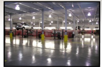
State of the Art Service Area