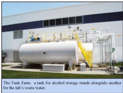
The Tank Farm: a tank for alcohol storage stands alongside another for the lab's waste water.