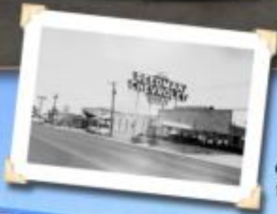
Chevrolet's facade 1964