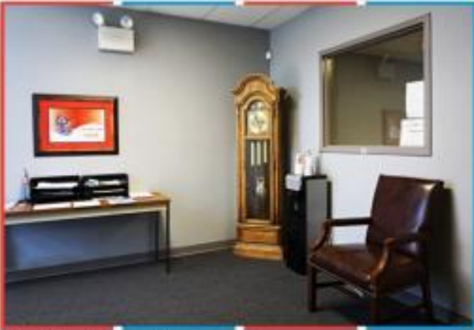
New lobby entrance with one way glass