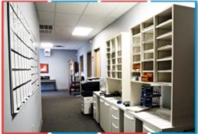
Hallway leading to testing lab