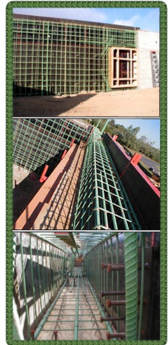
Reinforcing steel bars with an epoxy coating are used to provide "DLC".