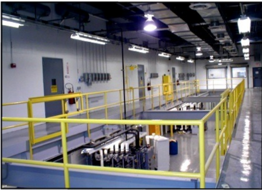
< Interior corridor within the manufacturing building provides access to multi-level production cells, first floor temperature control units, makeup air systems, process utility piping as well as raw material and finish product movement.