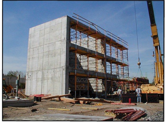
The manufacturing building is an H-3 occupancy constructed with reinforced concrete designed to meet the damage limiting requirements of NFPA 68.