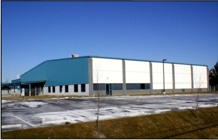
Gelest's Office-Warehouse is a pre-engineered building featuring Dryvit, metal siding, rockface and painted block. Vapor detection and emergency ventilation are included to meet the requirements of NFPA 69.