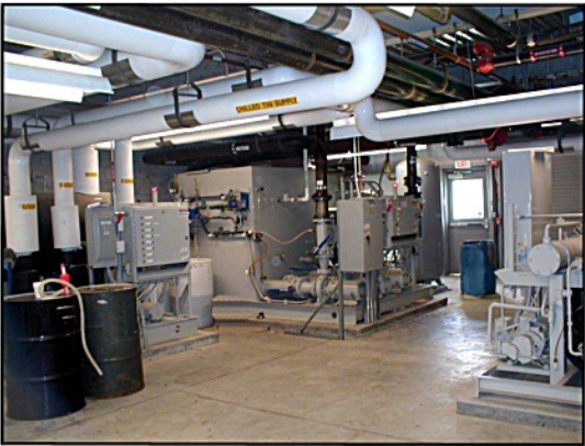
< Mechanical room in manufacturing building which houses the nitrogen generator, nitrogen storage tanks, feed air compressor, dryer for the nitrogen generator, cooling tower and tanks, chiller units and water heaters.