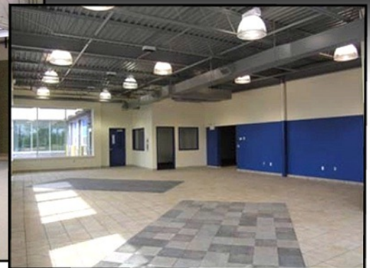
The new showroom awaiting display vehicles.